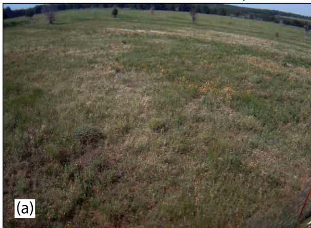
Marena, OK Phenocam - 11 August 2012