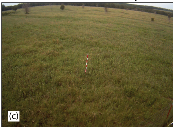
Marena, OK Phenocam - 11 August 2014